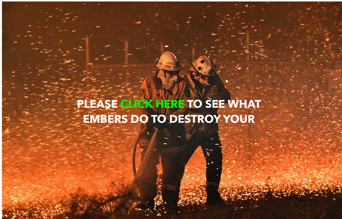
Firefighters struggle to protect homes from the embers generated by bushfires near the town of Nowra in New South Wales, Australia.