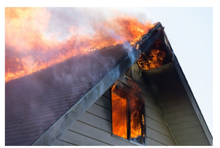
Embers can carry as far as a mile in the wind, and when they get into an attic, they can start a fire