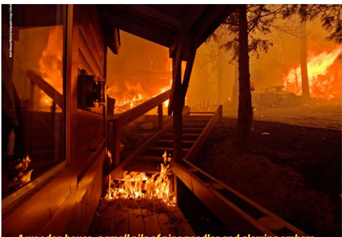
A wooden house, a small pile of pine needles and glowing embers...

Maintain wooden fences in good condition and create a noncombustible fence section or gate next to the house for at least five feet.